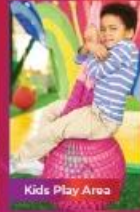
Kids Play Area