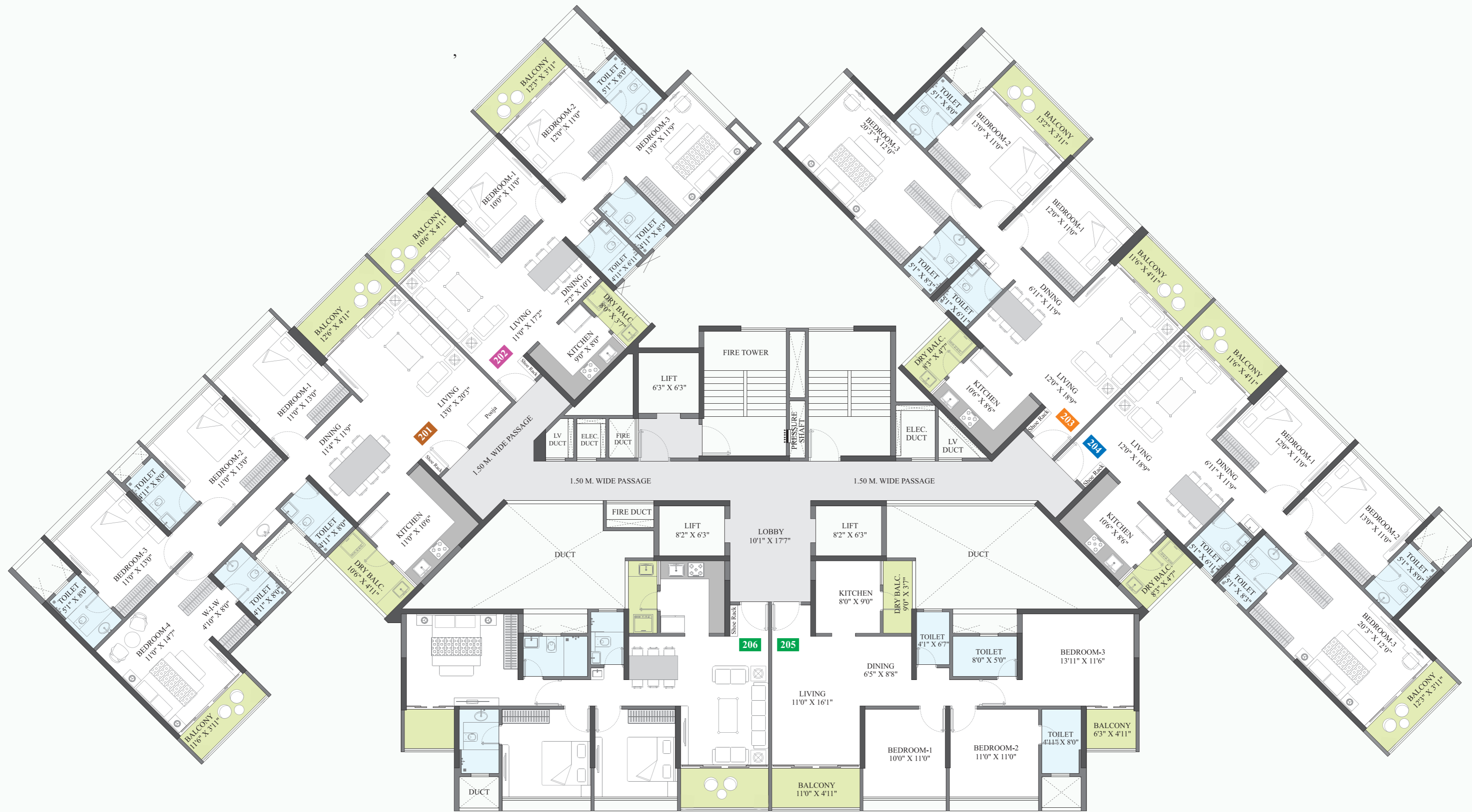
TYPICAL FLOOR AREA STATEMENT

Typical Floor Plan 2nd, 3rd, 5th, 6th, 7th, 8th, 10th, 11th, 12th, 13th, 15th, 16th, 17th, 18th, 20th, 21st, 22nd, 23rd Floor