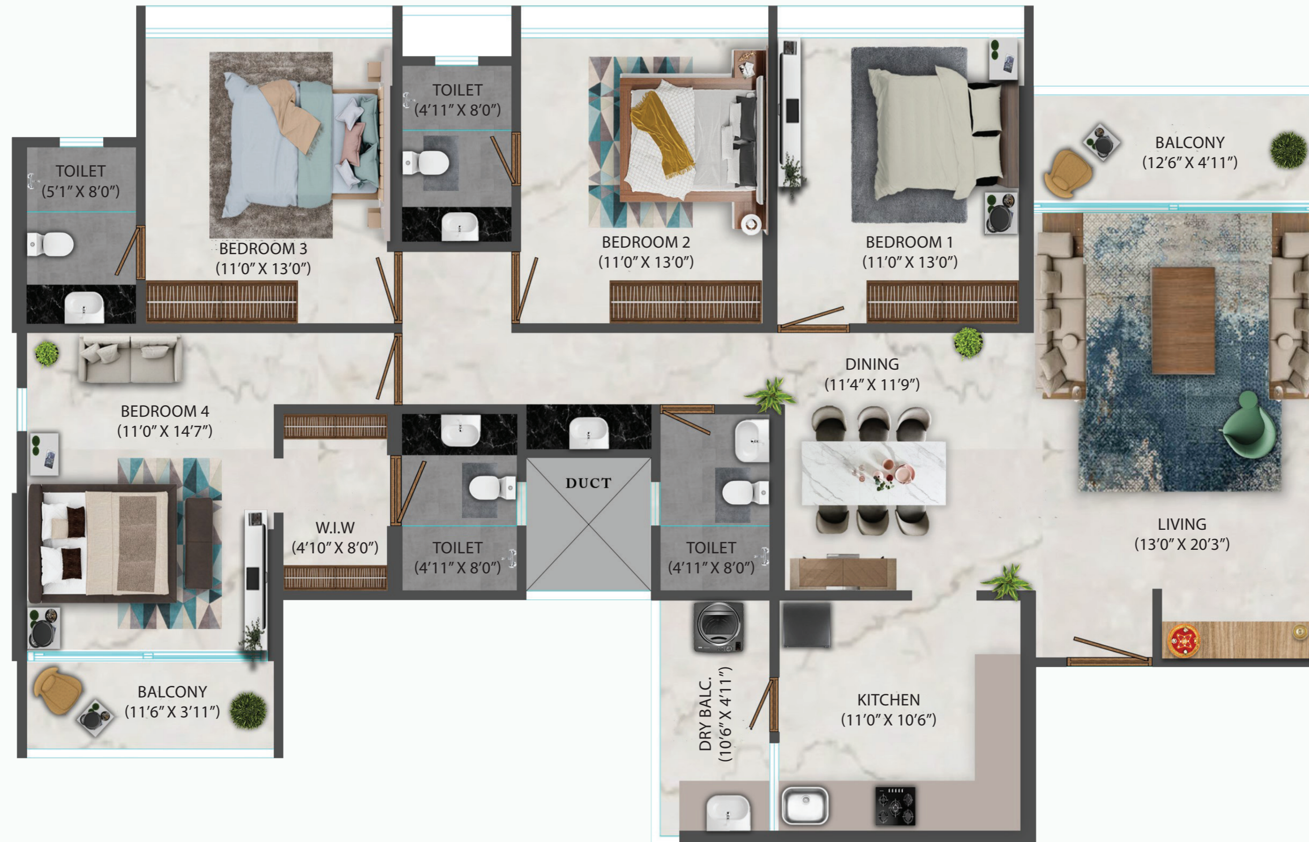
AREA STATEMENT - 4BHK Radience