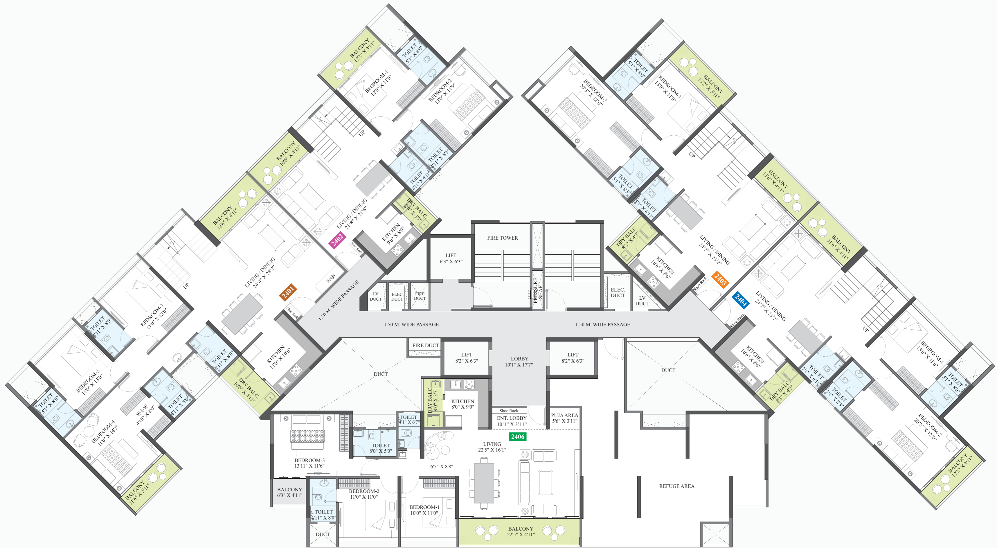
24TH FLOOR AREA STATEMENT