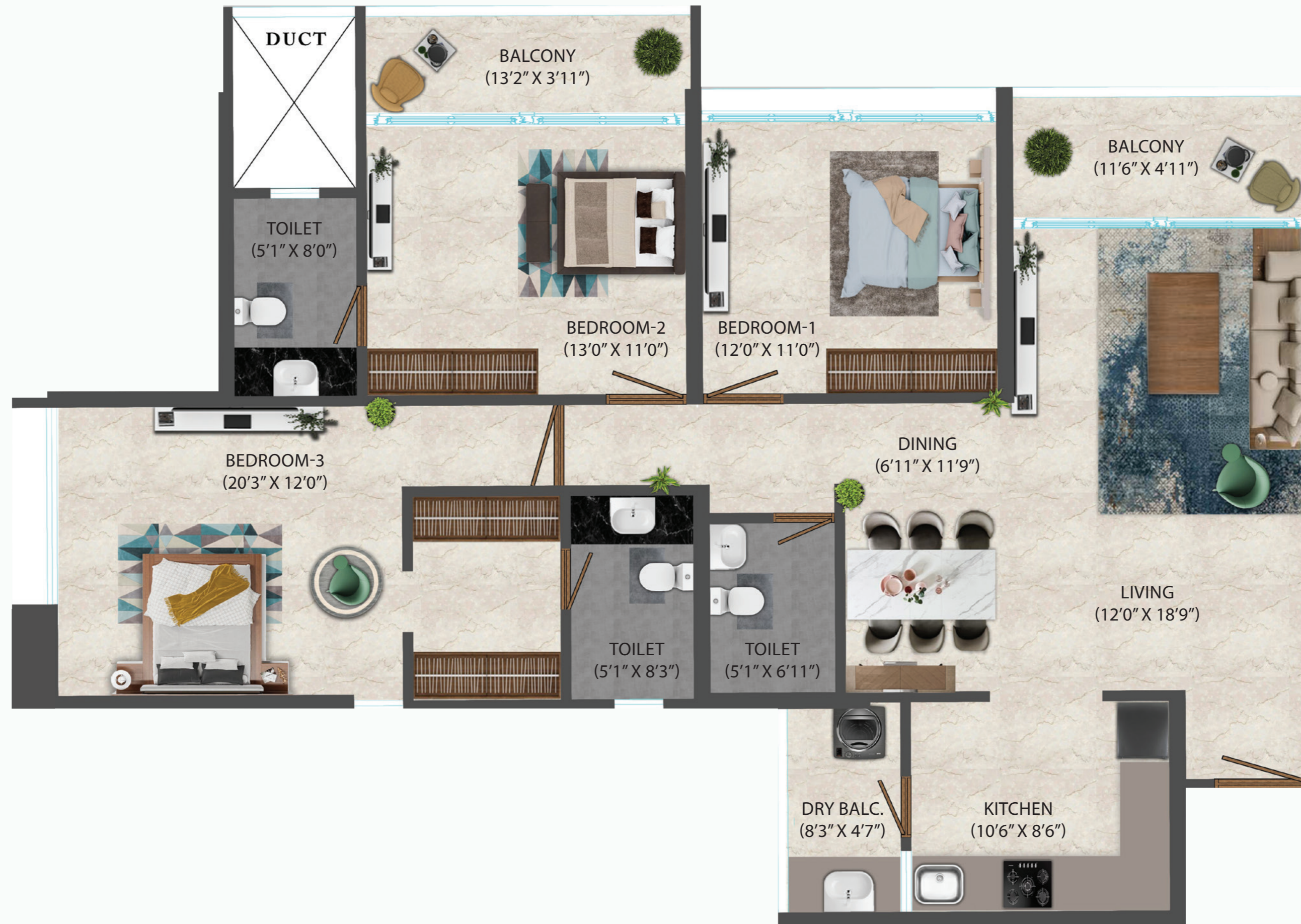
AREA STATEMENT - 3BHK Radience