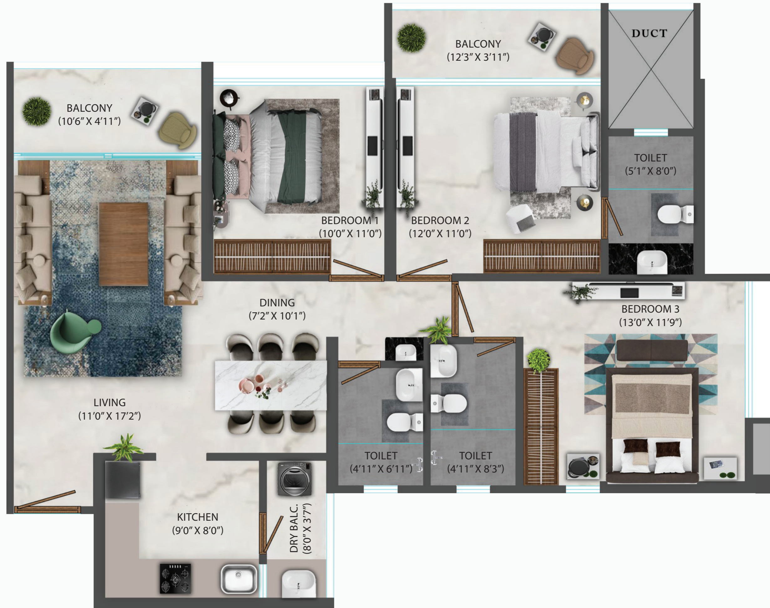
AREA STATEMENT - 3BHK Radience