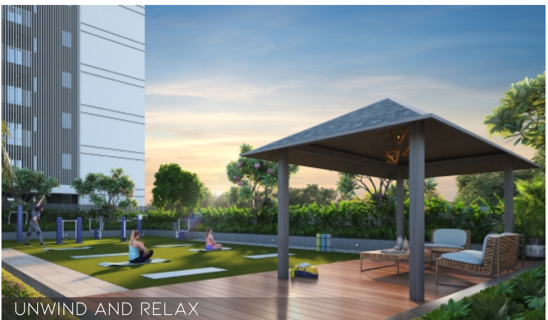
UNWIND AND RELAX