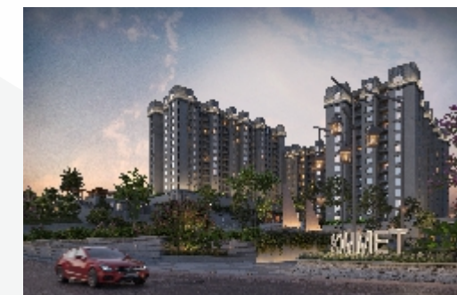
SOMMET LAKESIDE RESIDENCIES