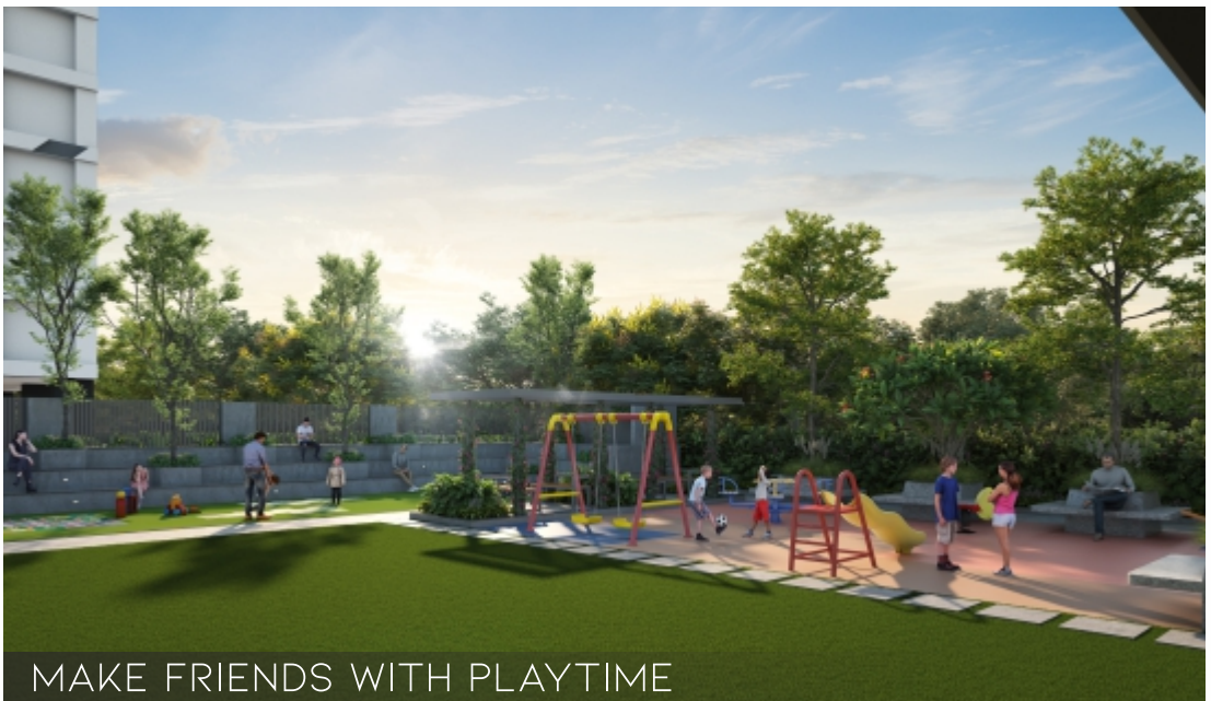
MAKE FRIENDS WITH PLAYTIME