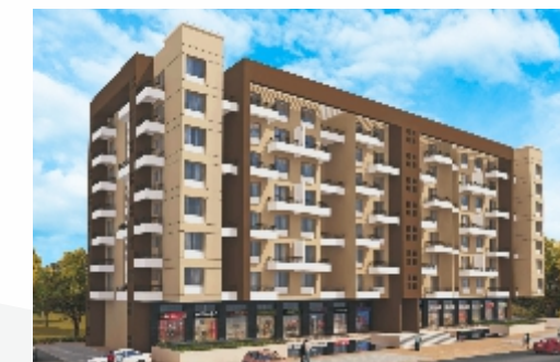
JAYMALA BUSINESS COURT