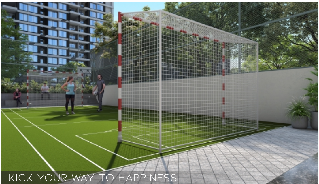
KICK YOUR WAY TO HAPPINESS