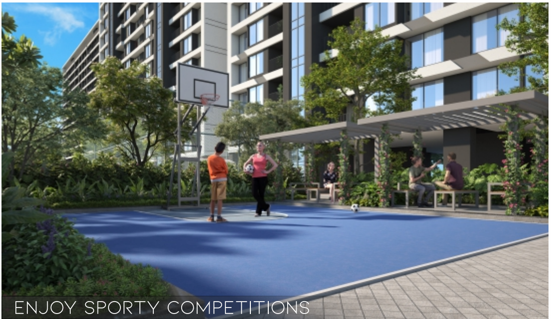
ENJOY SPORTY COMPETITIONS