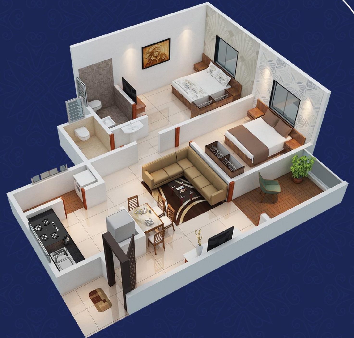
2 BHK - 745 Sq Ft