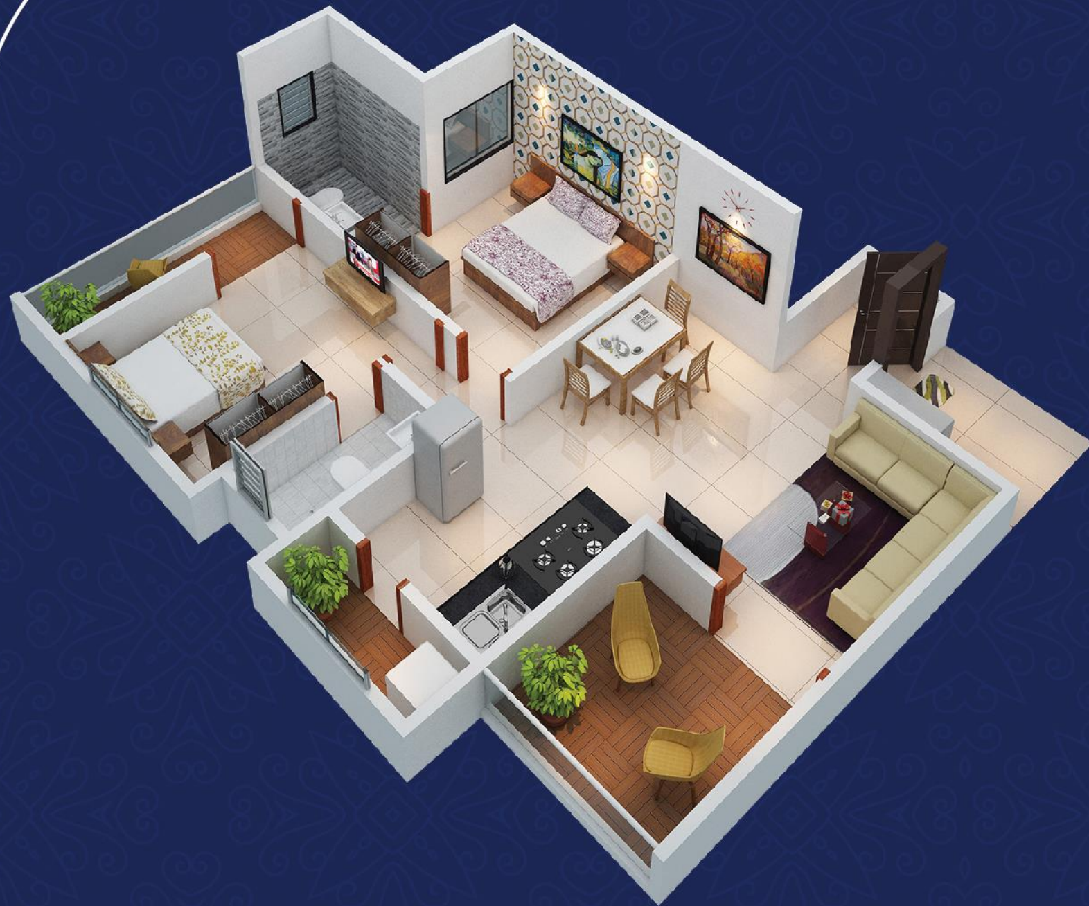
2 BHK - 828 Sq Ft