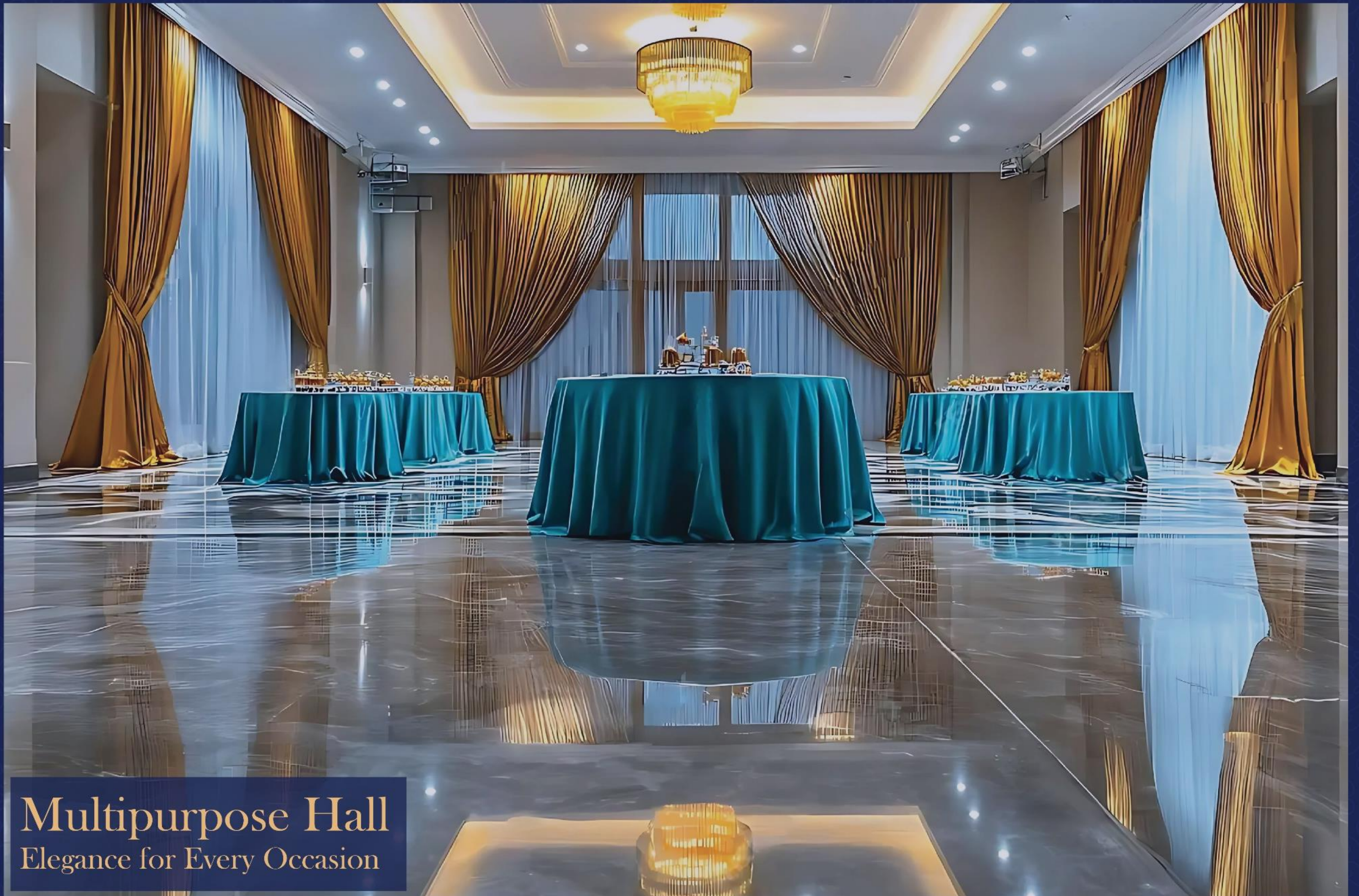
Multipurpose Hall Elegance for Every Occasion