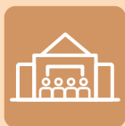
Community Hall (use on chargeable basis)