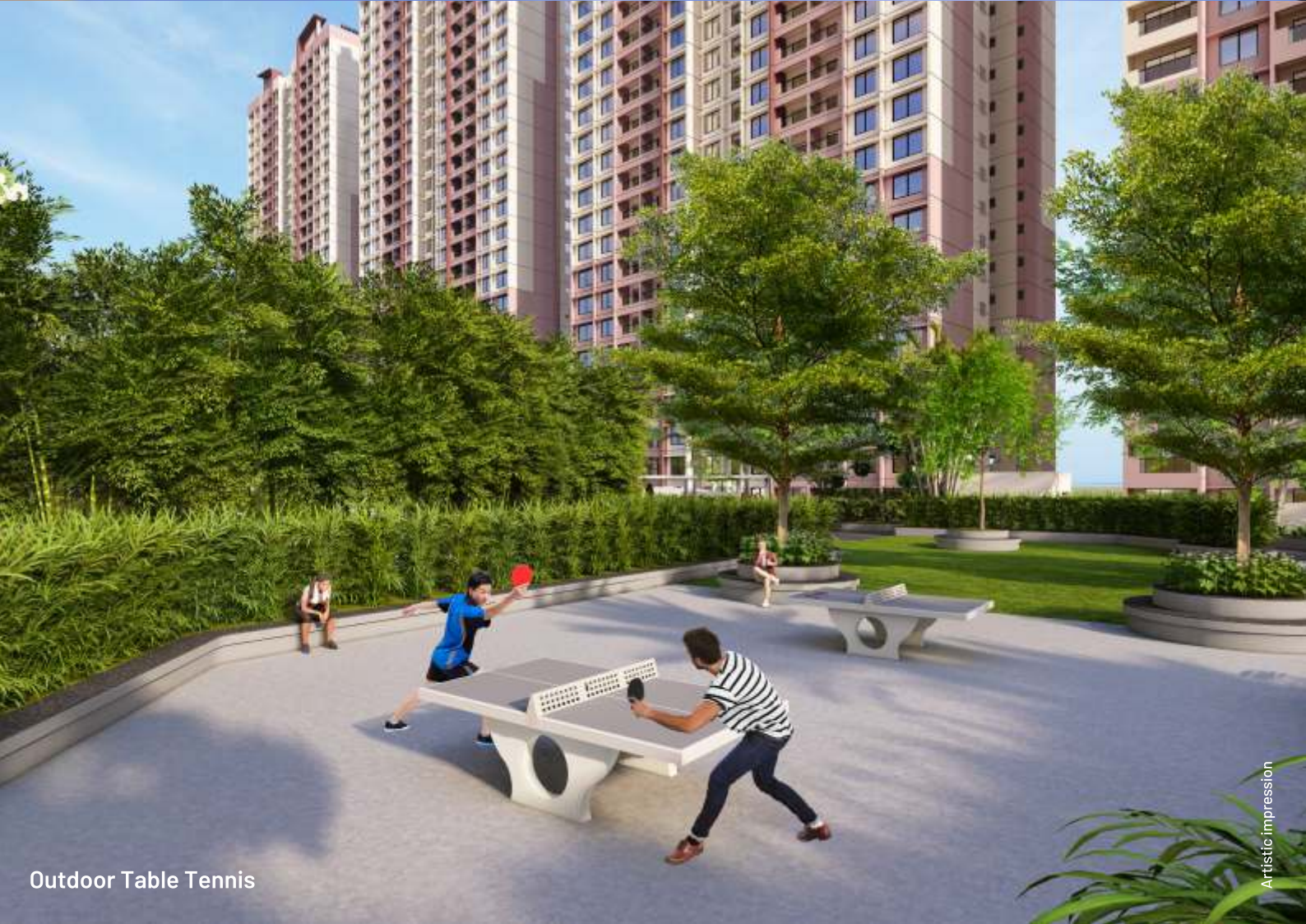
Outdoor Table Tennis