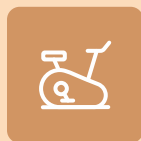
Gym & Yoga Room (use on chargeable basis)