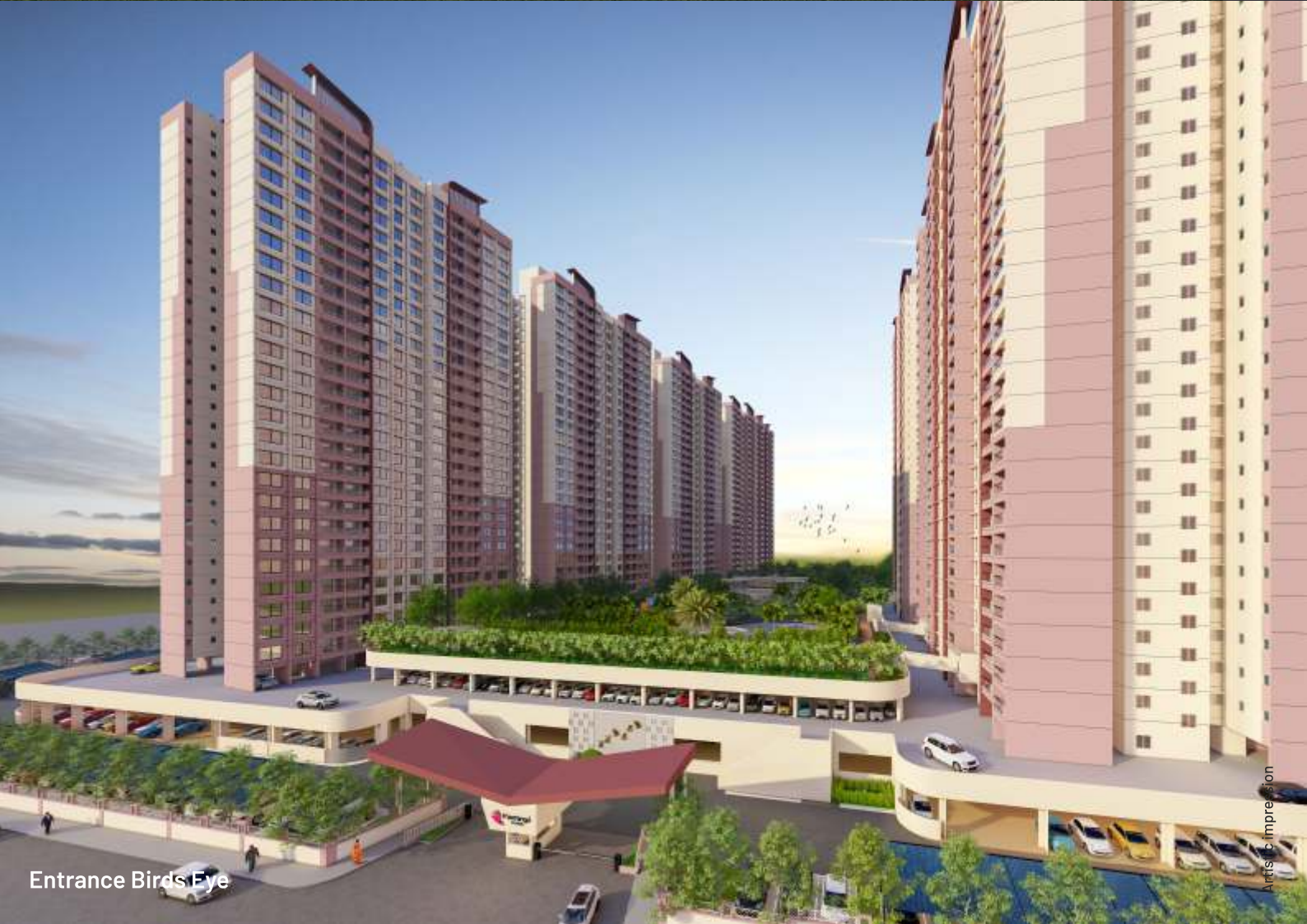
Entrance Birds Eye