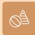
Indoor & Outdoor Creche (use on chargeable basis)