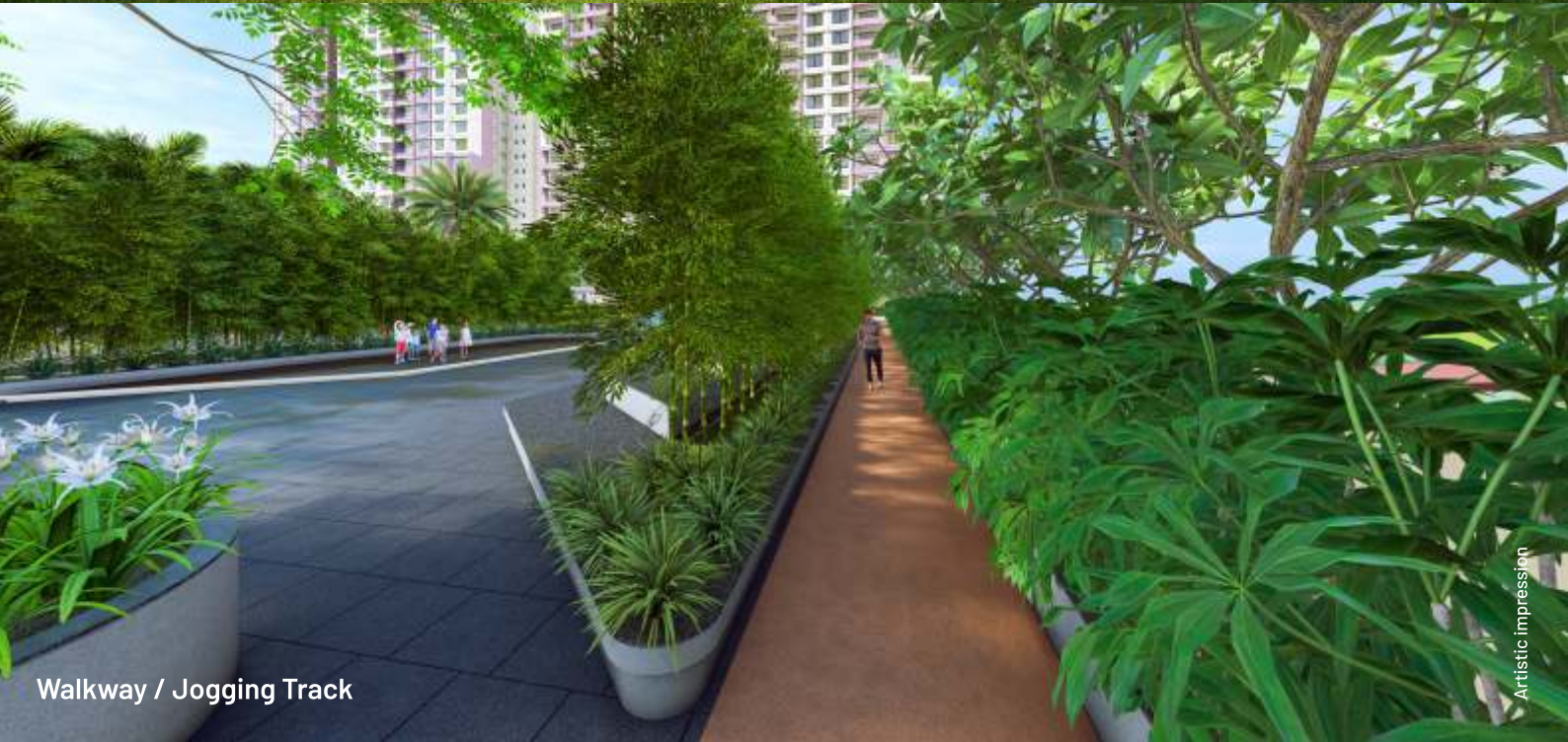
Walkway / Jogging Track