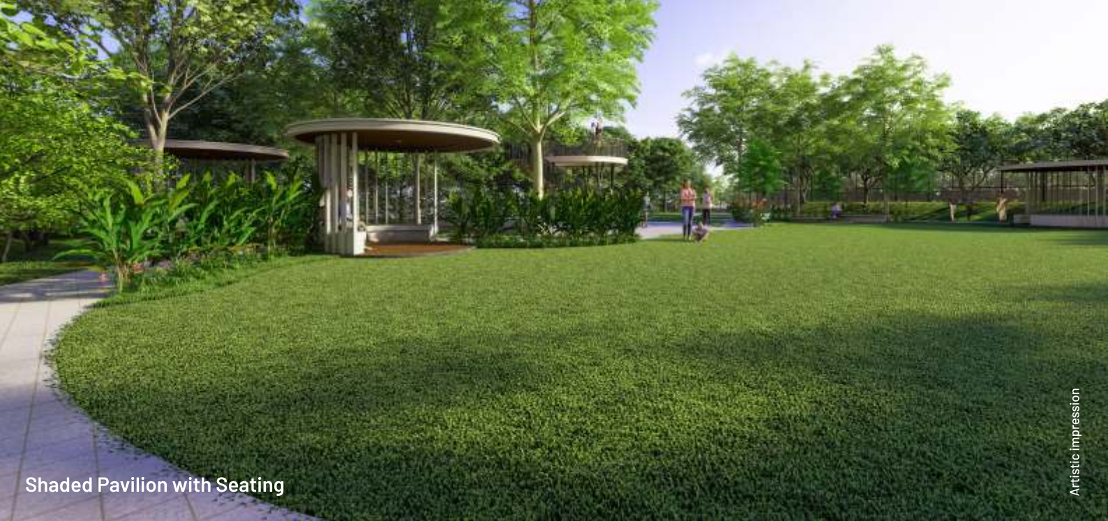
Shaded Pavilion with Seating