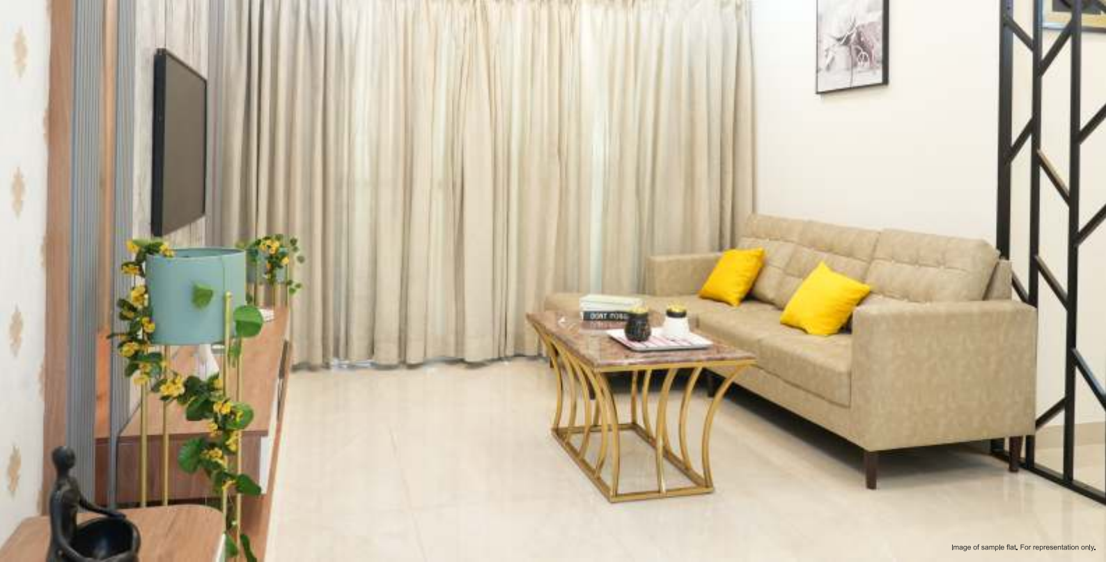
Image of sample flat. For representation only.