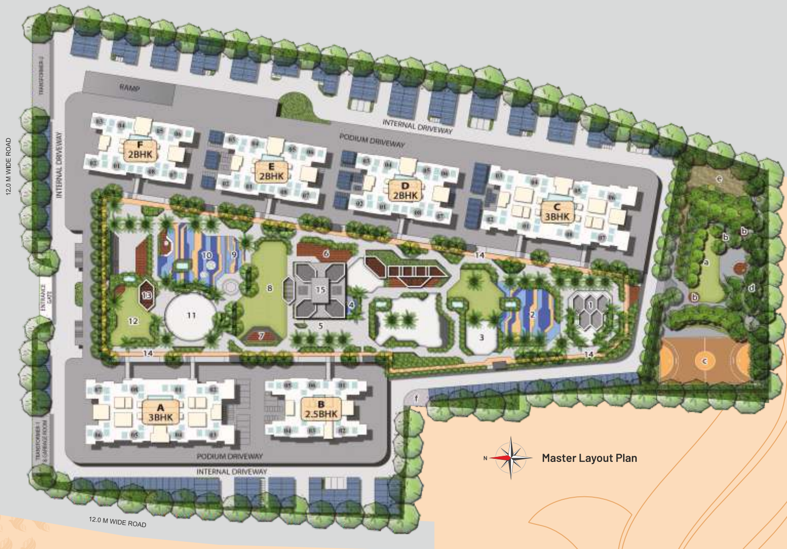
Master Layout Plan