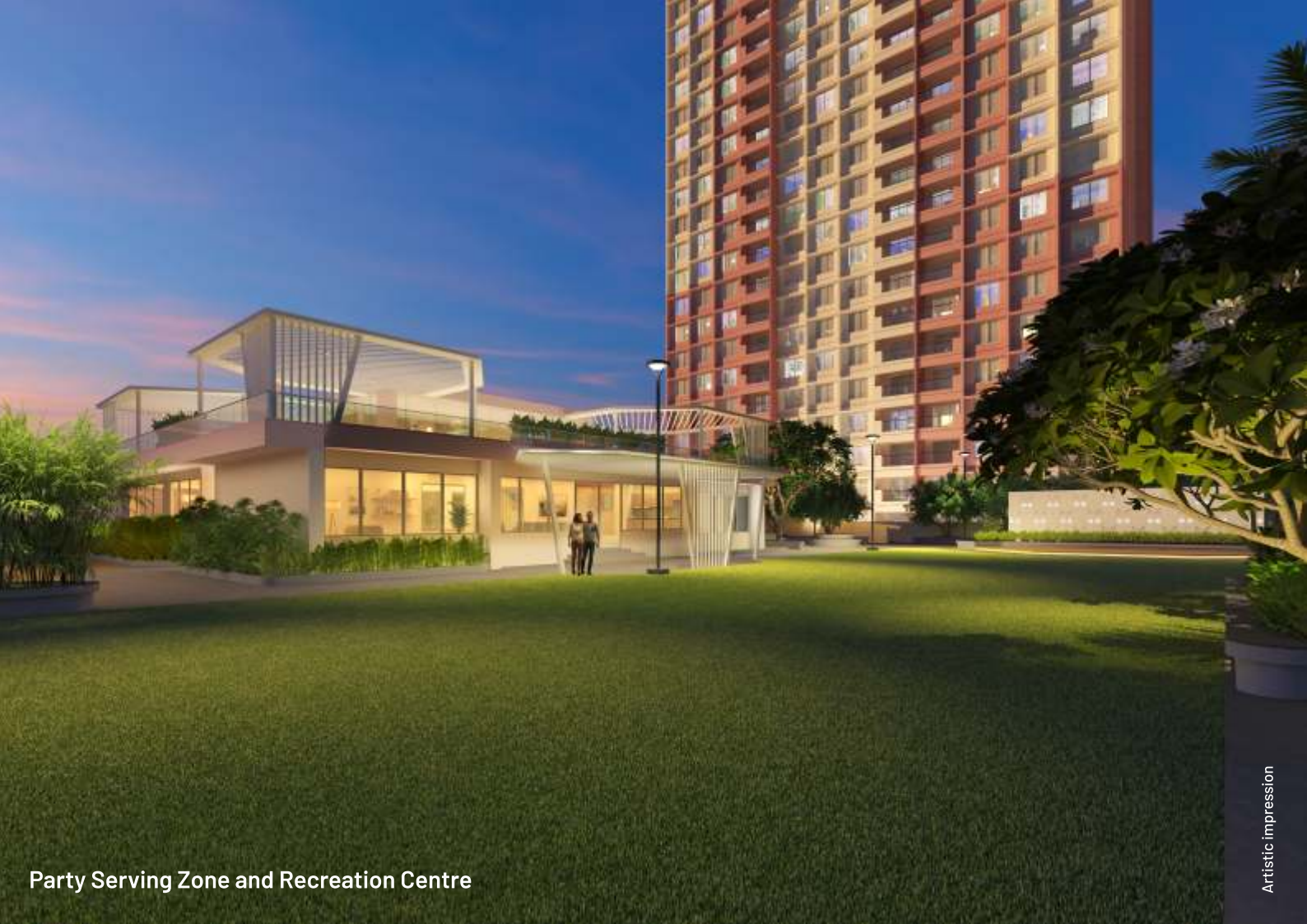
Party Serving Zone and Recreation Centre